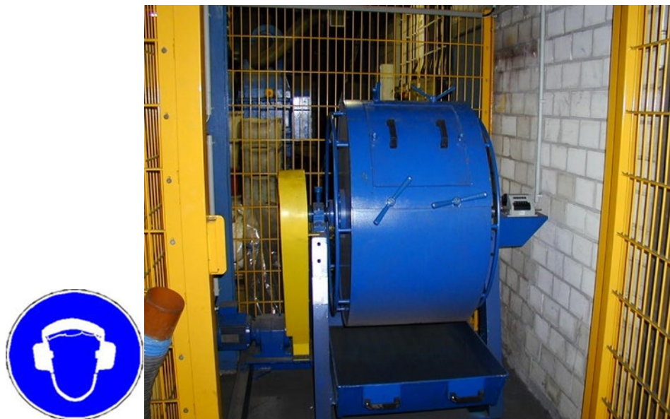
Figure 6: The tumble drum for determination of the tumble and abrasion index (ear protection required!)

An ISO standardized procedure is described in: ISO 15967 - direct reduced iron - determination of tumble and abrasion indices of hot briquetted iron (HBI) . According to this standard, an abrasion drum with a diameter of 1,000 mm and a width of 500 mm with two lifters is used. Similar equipment is also used to test iron ore pellets and is illustrated in Figures 5 and 6 above. The rotational speed is defined with 25 rpm. The test is finalized after 200 revolutions.