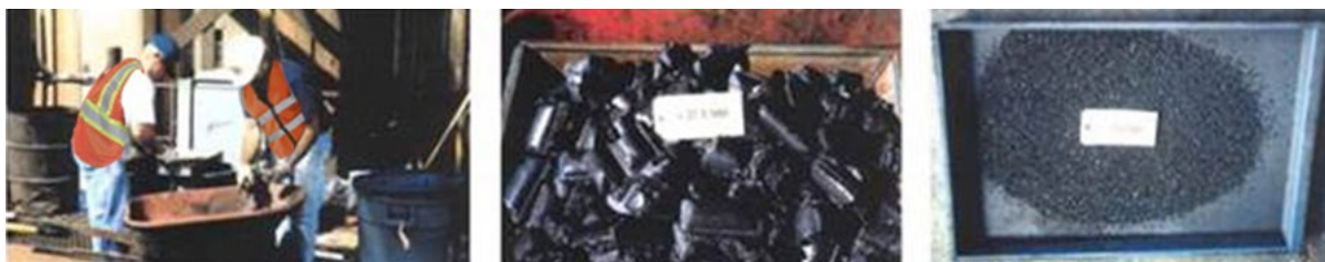
Figure 3: Screen Size Testing

Sampling for analysis of particle size distribution may be performed in the field either during vessel discharge or following re-load to conveyor belts for transport to the final customer. Typically, these are collected, photographed, and presented to the client along with size fraction percentage data and graphs, in order to substantiate cargo quality guarantees by the supplier. Suitable sub-sample size fraction increments are: +37.5mm, +25mm, +19mm, +12.5mm, +9.5mm, +6.3mm, +4.0mm, and minus 4.0mm.