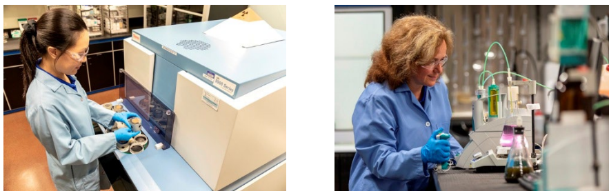
Figure 7: Chemical analysis laboratory

The chemical composition of interest to the consumer of HBI include iron (total iron, metallic iron), carbon, sulphur, phosphorus and gangue (primarily CaO, SiO 2 , MgO and Al 2 O 3 ) as they will impact how the HBI is melted into subsequent product.