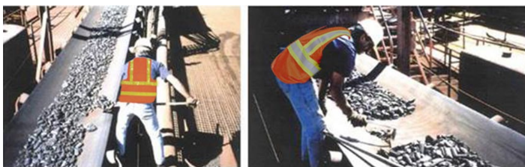
Figure 1: Surveyors collecting increments using “stopped belt sampling”

Sampling should normally be done by cutting a complete cross-section of the HBI stream at a transfer point while a lot is being conveyed to or from the ship, stockpile, or container, using a mechanical sample cutter. The cutter aperture of the primary sampler shall be at least three times the longest dimension of the HBI. This requires a cutter with an effective aperture of at least 300 mm (~1 foot).